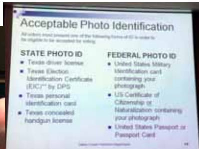
Left: Attendees learn about the Voter ID law.